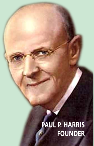
PAUL P. HARRIS FOUNDER